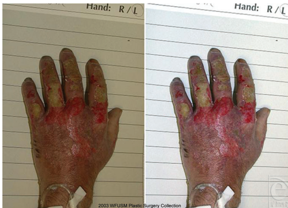
Figure 3. Digital image quality of a clinical image from the prospective multicenter trial before (left figure) and after (right figure) adjustment with Adobe Photoshop.