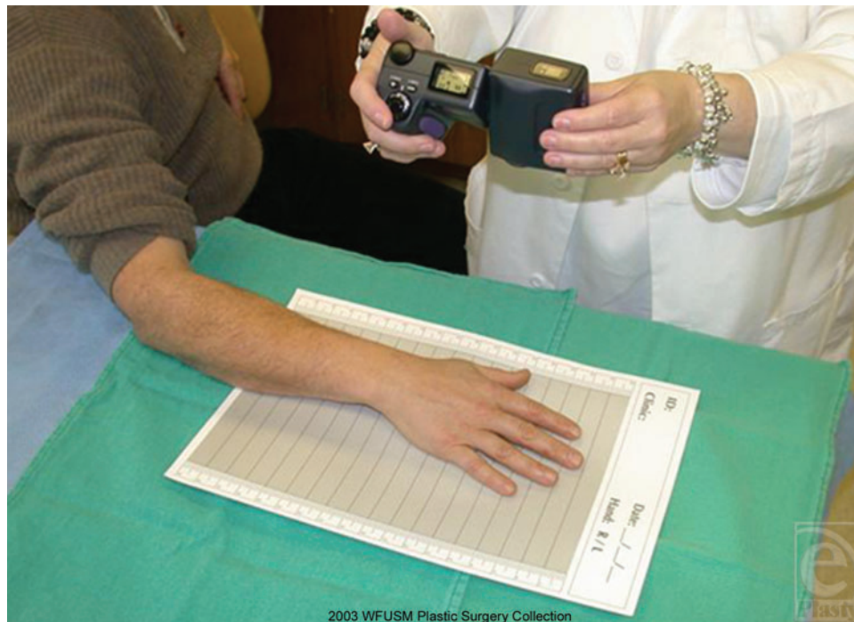
Figure 2. For validation of the technique, images were captured with the standardized background and digital camera in the manner to be used in the clinical study.